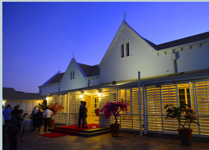
The new Fellows presentation was held at Government House