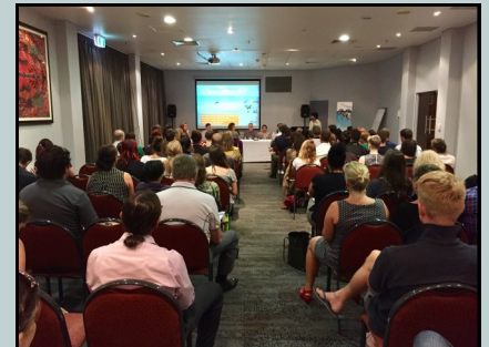
Attendees at the Darwin information session